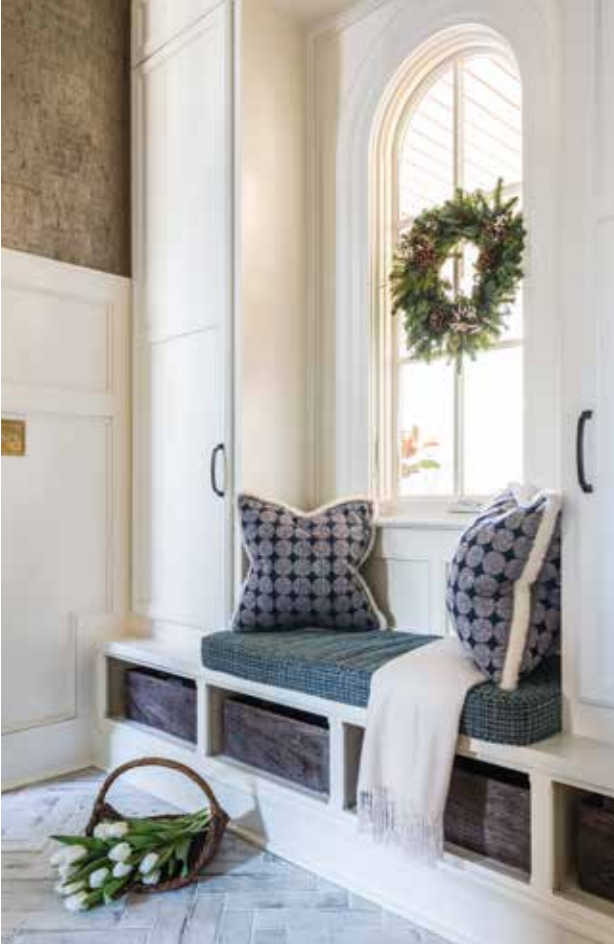
CLOCKWISE FROM ABOVE LEFT: A mercury glass container with hyacinth, 'Silver Bell' eucalyptus pods, phlox, and cone leucadendron with cedar and 'Carolina Sapphire' cypress • Even the mudroom is decorated for the season. • Scott and Christy Goudy and Caroline, one of their three daughters, enjoy the outdoor fireplace decorated with magnolias. • The sun-drenched breakfast space shows off a lively botanical print from Telafina on windows decorated with a classic Weston Farms Magnolia wreath. Diane added a mix of white flowers in mercury glasses for the table.